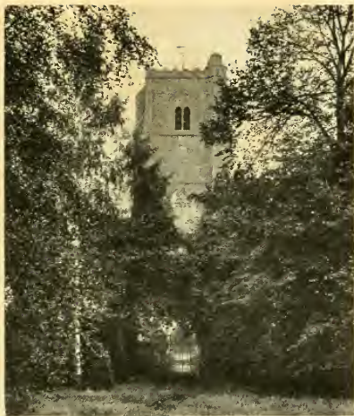
ST. ANDREW'S CHURCH, HINGHAM. NORFOLK, ENGLAND, AS SEEN FROM THE RECTORY GROUNDS.