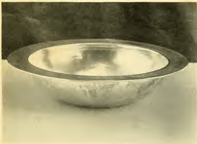
THE EARLY SEVENTEENTH CENTURY PEWTER BAPTISMAL BASIN, OWNED BY THE FIRST PARISH, BELIEVED TO HAVE BEEN BROUGHT FROM ENGLAND BY THE FIRST SETTLERS. IT HAS BEEN IN CONTINUOUS USE FOR NEARLY THREE CENTURIES. DIAMETER 13 INCHES; DEPTH 3 INCHES.